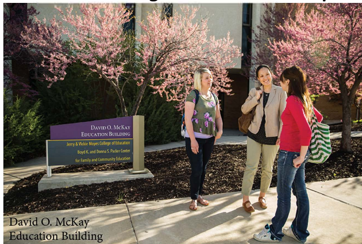
David O. McKay Education Building